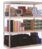
SHELVING & DRAWERS