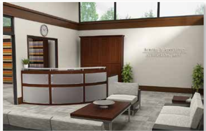
Reception Area Cabinets