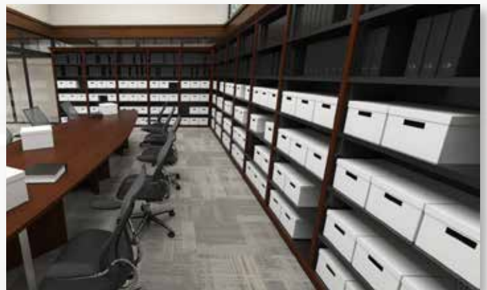
Legal Case Room