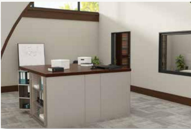
Times-2 Collaborative Counter