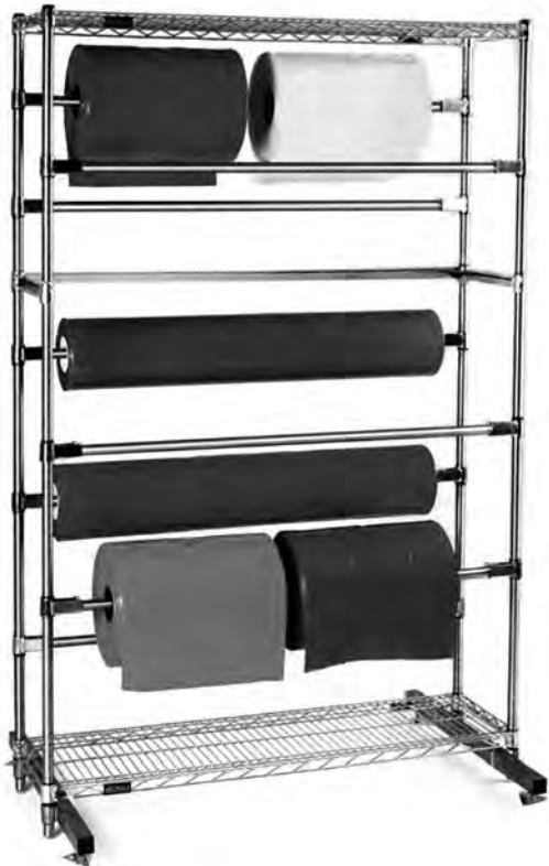
roll bag dispenser