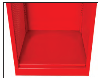
Solid base shelf also an option