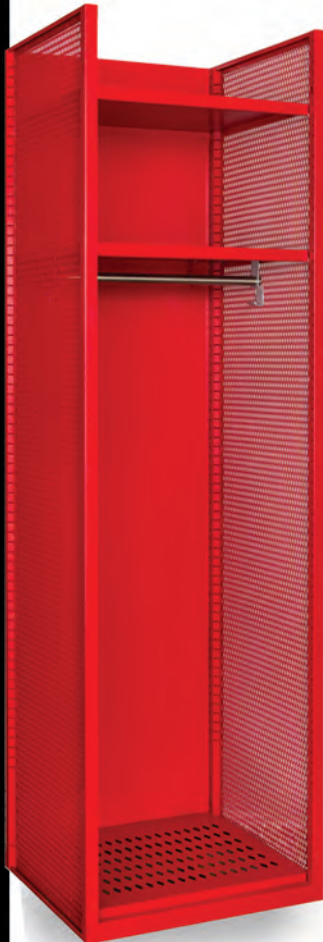
Base Model Without Base

Choose from 4 models of Turn Out Gear / Firefighter Lockers