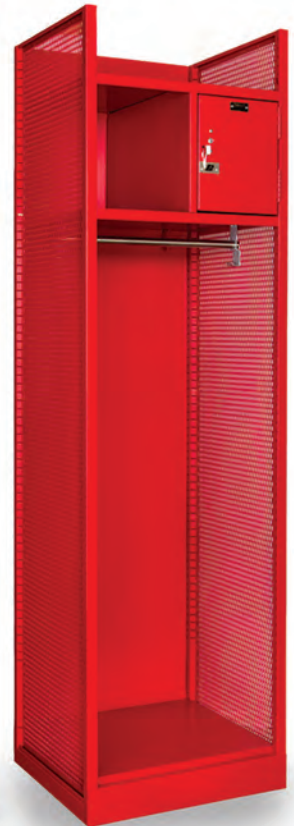
With Upper Security Box With Base