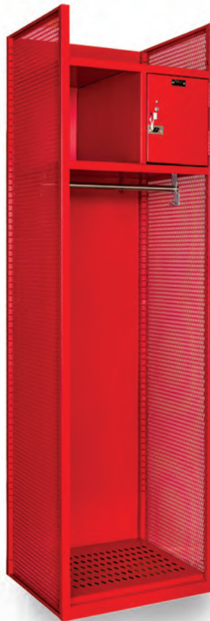
With Upper Security Box Without Base