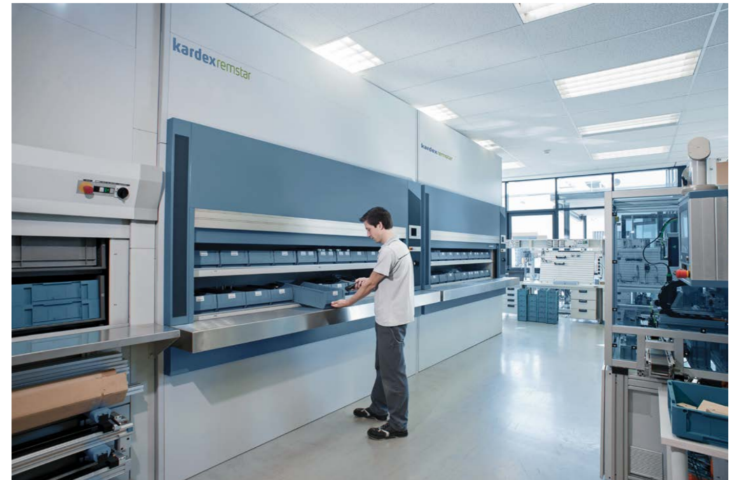
Spare parts management with Kardex Megamats

Further options and storage environments with air conditioning, clean room, fire protection or esd versions are available.