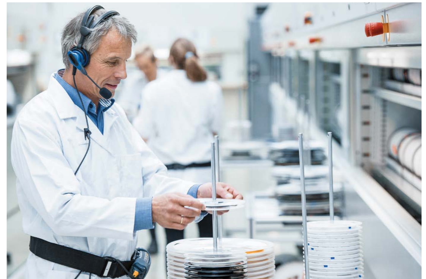
SMD handling with Kardex Megamats