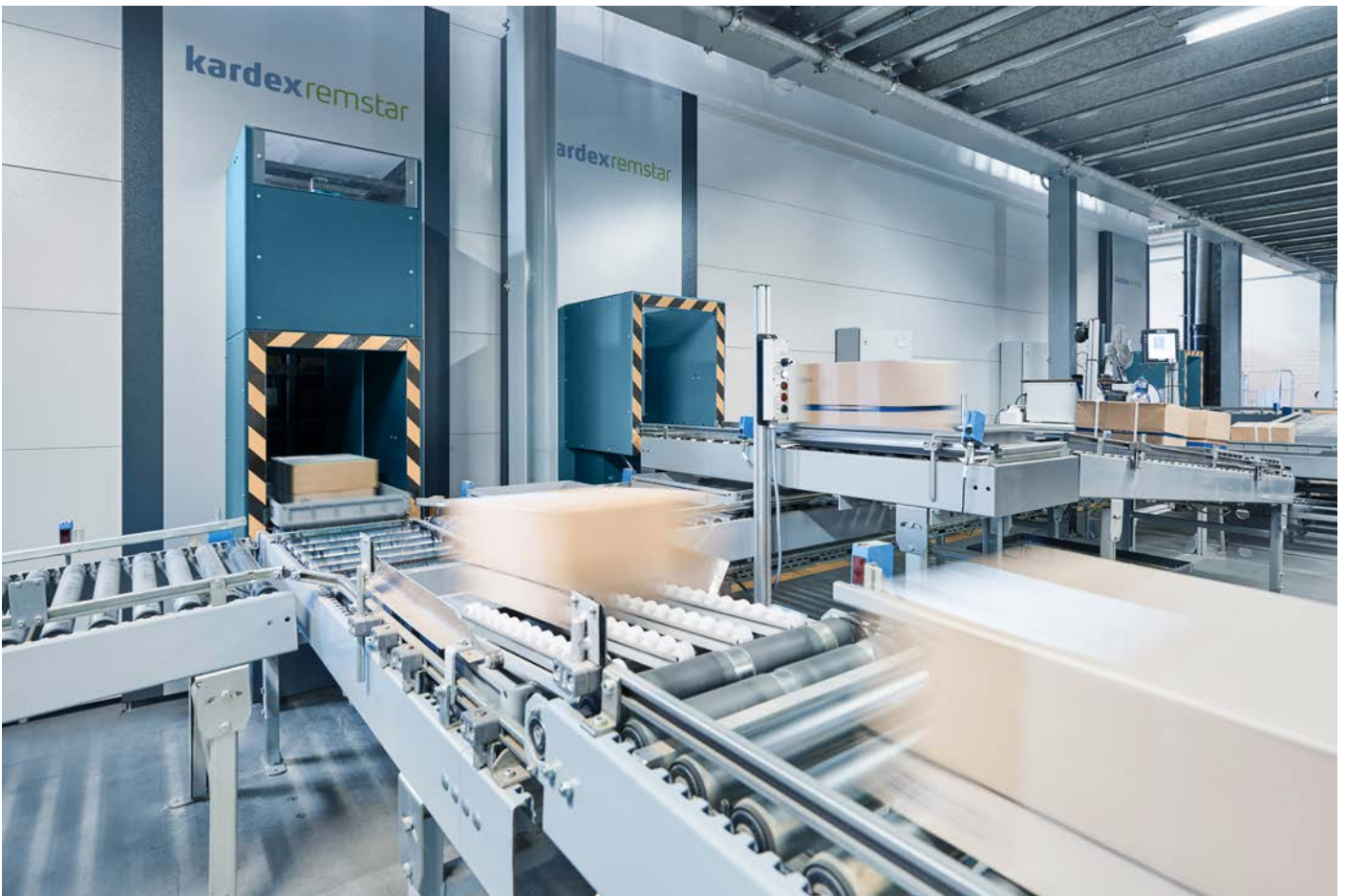
Order consolidation with automatic conveyor connection