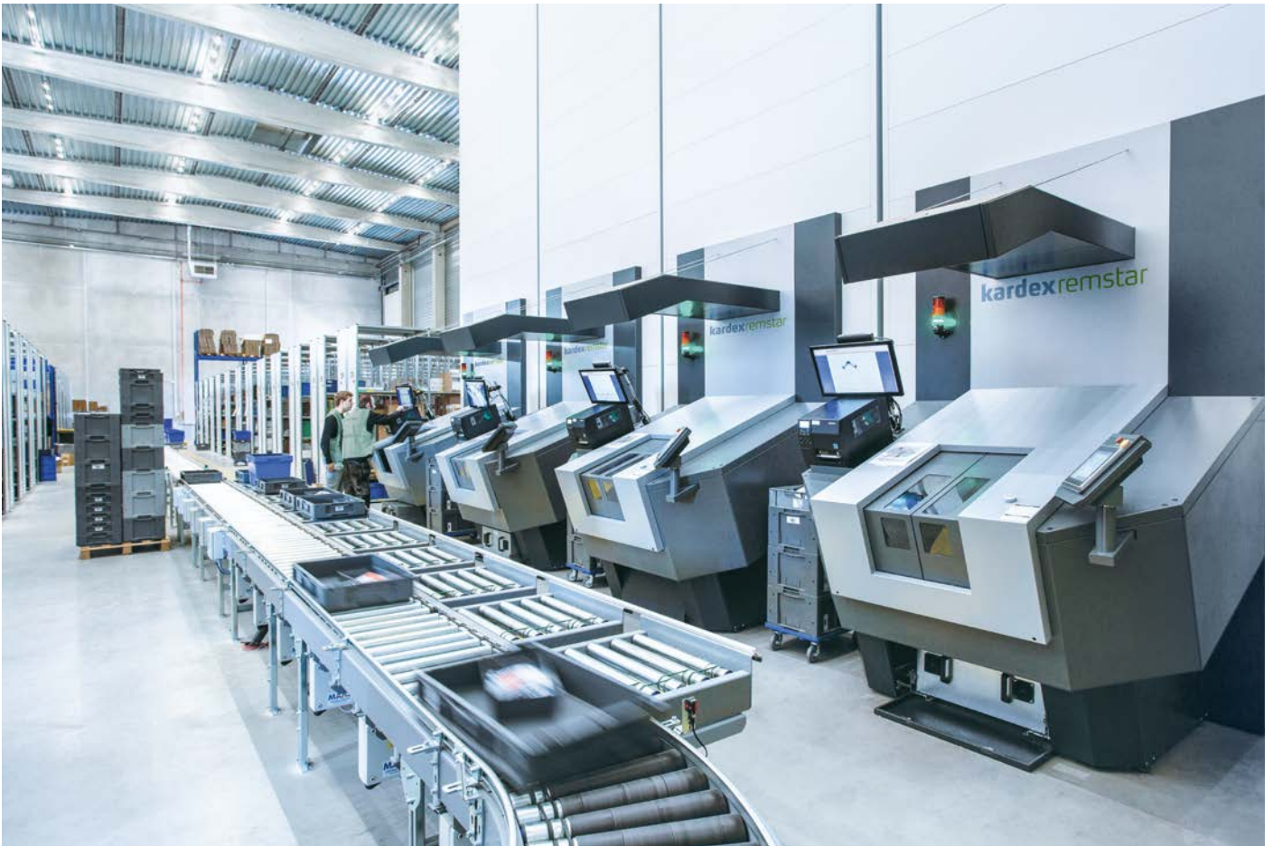
Order picking with turntables and a conveyor system with put locations