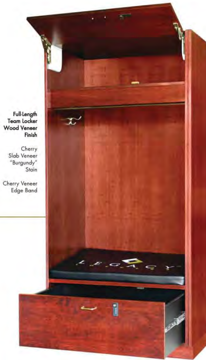
Full Length Team Locker Wood Veneer Finish