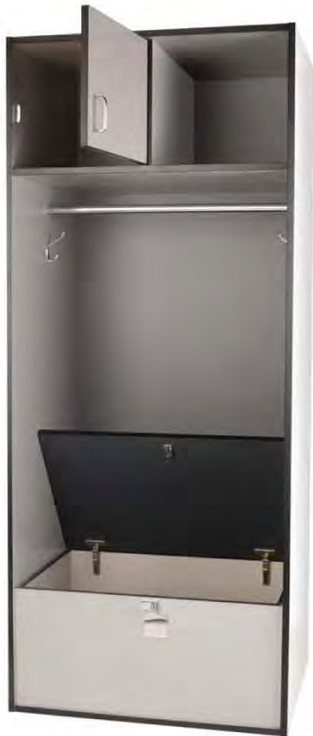
Full Length Team Locker Laminate Finish