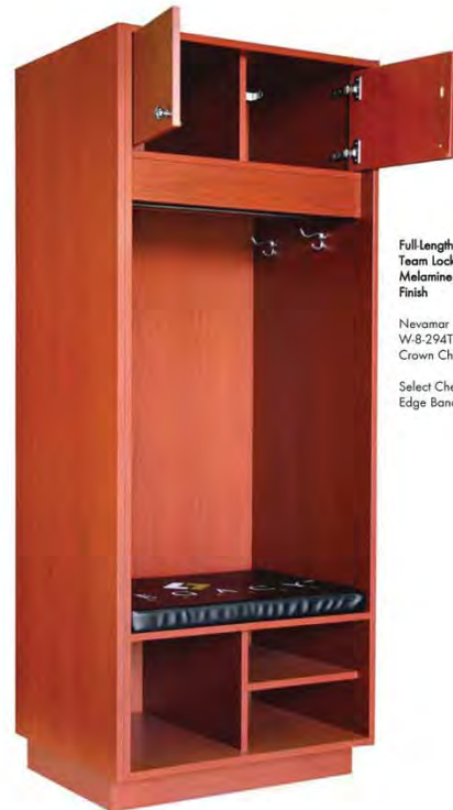
Full Length Team Locker Melamine Finish