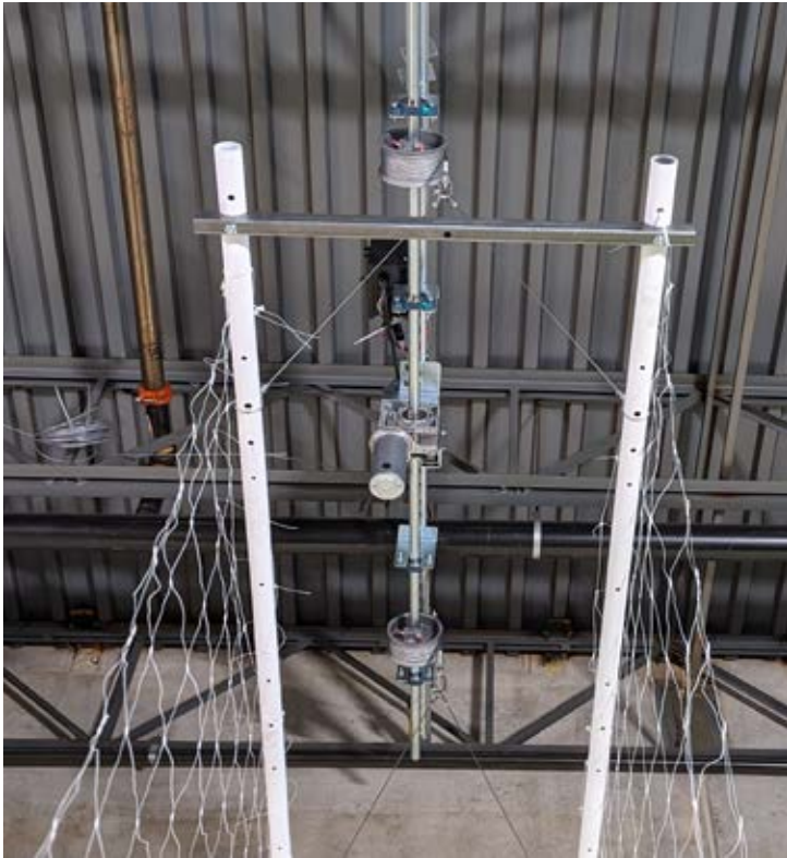
Double Bar Net Rack