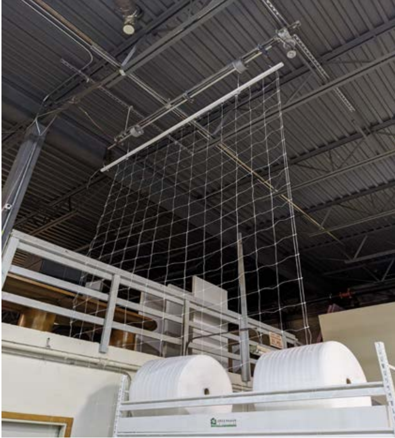
Single Net Rack

3 in 1 drying racks can be used as a single 8 ft net drying rack, a rack with 2 net drying racks, or as a rack with two bars for use with hangers. Growers can use the configuration that is best suited for their needs. Comes with a 90 day money back guarantee.