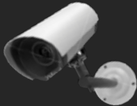
Wireless security system