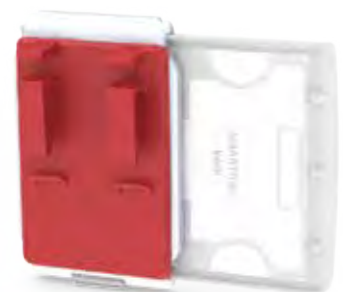
Removable Clip RFID Tag