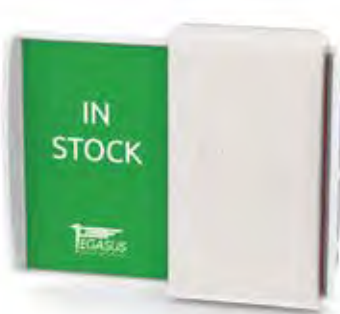
Sliding RFID Label

THE RFID SYSTEM ONLY REQUIRES A SINGLE LAN CONNECTION AND POWER SOURCE