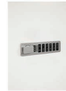
HORIZONTAL DIGITAL LOCK #MH-K2