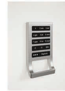
DIGITAL LOCK #DK-ATS