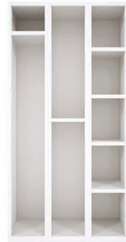
STEEL STOR SERIES