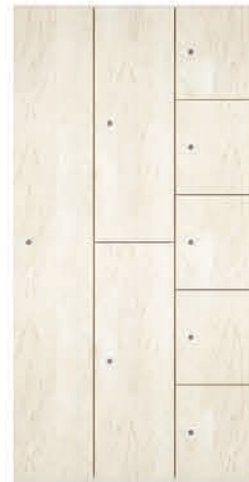
REAL WOOD VENEER 67 SERIES