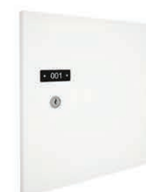
STANDARD NUMBER PLATE #033