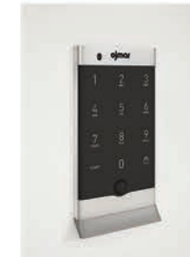
ELECTRONIC LOCK #OC-PRO