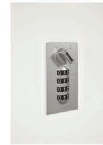
COMBINATION LOCK #RCBL-01