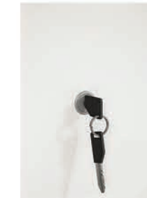
STANDARD LOCK #1205