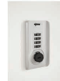
COMBINATION LOCK #COMBI-8001