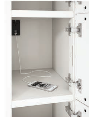
ONE POWER OUTLET TWO USB CONNECTIONS