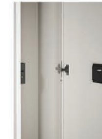
ELECTRONIC RFID LOCK #CA-7000