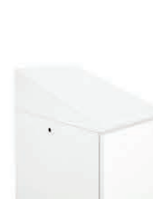
SLOPED TOP #006-OF