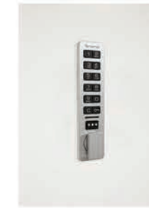
VERTICAL DIGITAL LOCK #MV-K1