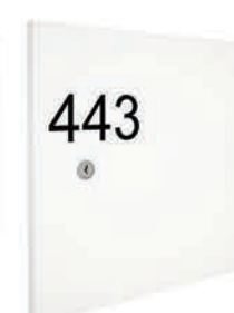
DESIGN NUMBER PLATE