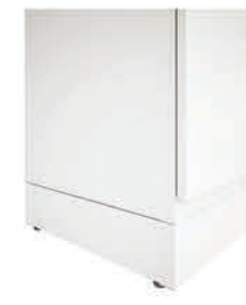
BASE WITH LEVELLERS #003-NIV