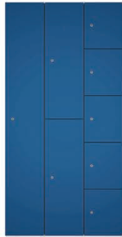
STEEL 52 SERIES