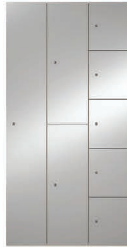
STAINLESS STEEL LAMINATE 54 SERIES