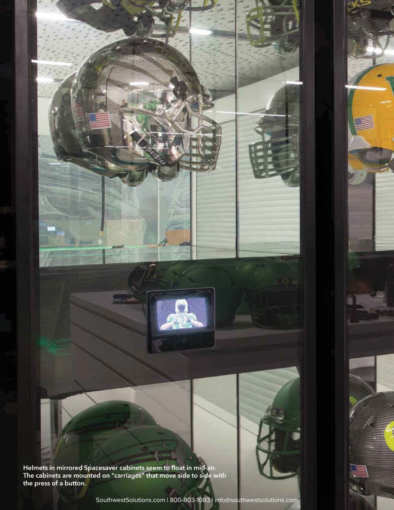
Helmets in mirrored Spacesaver cabinets seem to float in mid-air. The cabinets are mounted on "carriages" that move side to side with the press of a button.