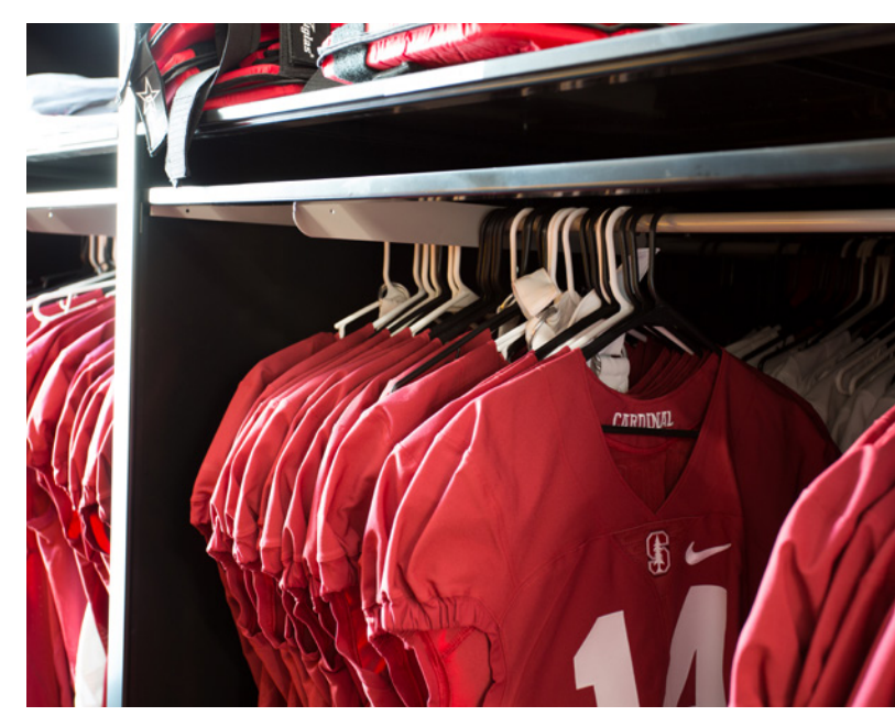
Shelf dividers, garment hanging rods, and modular bins provide convenient storage for a wide variety of athletic equipment and supplies.