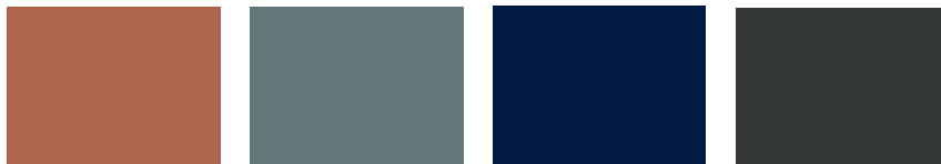
Red Iron RI (252)