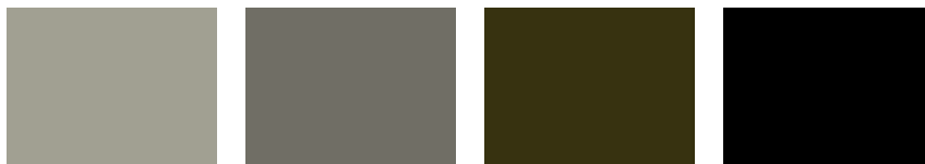
Designer Grey DG (2)