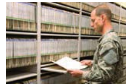
Records Management Solutions Consolidate medical records and sensitive documents in central, supervised areas close to the point of need. Controlled access allows you to increase accountability and better manage your files.