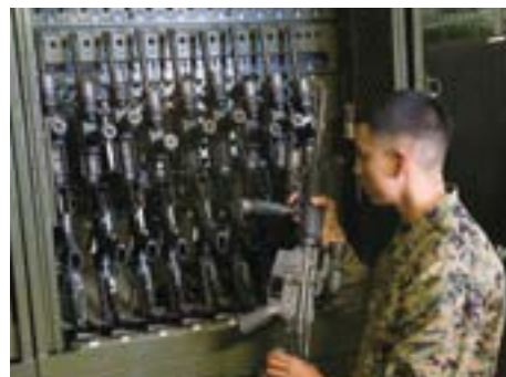
UWR™ Storage System

As all military branches strive to forge a more transformable fighting force, Spacesaver stands ready to deliver storage solutions that combine maximum security with operational readiness – for any deployment scenario.