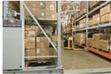
High-Density S6 Industrial Mobile Storage Systems From blankets, boots, coats and cots, to parachutes, life vests, inflatable life boats and emergency medical kits, our High-Density S6 Industrial Mobile Storage Systems let you warehouse bulky items in half the space of conventional storage options, with secure access control.

Assurance that supplies will be there when you need them. Adaptability to changing equipment. Logistics and supply operations encompass the most vast storage needs in any military branch. And demand solutions every bit as broad and varied.