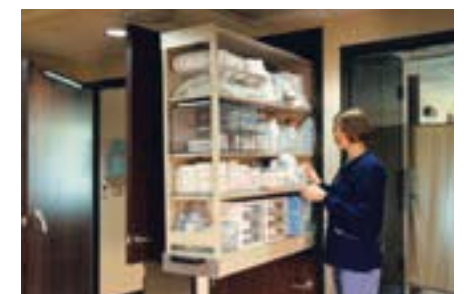
In-Room Patient Storage System Restock medical supplies in the hallway, then conveniently access them inside the room when needed for the patient. Our In-Room Patient Storage System can help reduce the number of in-room intrusions and interruptions, which can increase the potential spread of germs and the transfer of hospital-acquired infections.