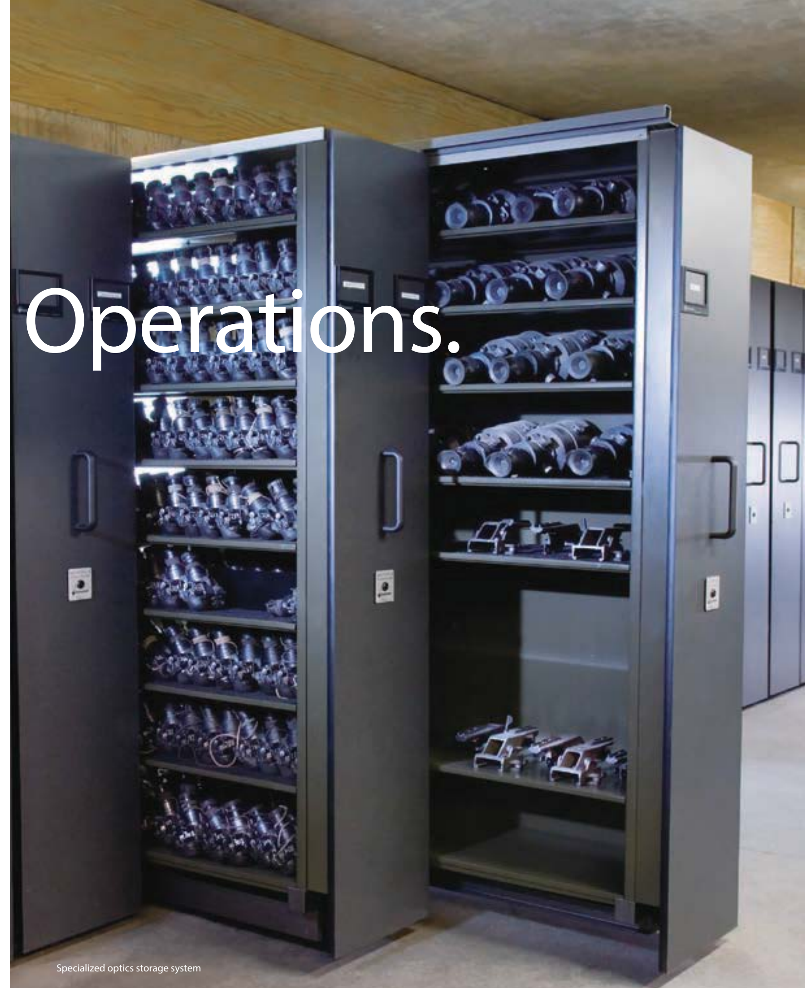
Specialized optics storage system