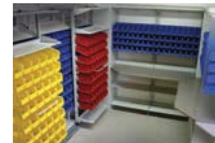
FrameWRX™ Storage Systems The most adaptable healthcare storage system available, our highly modular, fully flexible FrameWRX™ Storage System is perfect for providing highly customizable storage in any area of your military hospital or clinic.