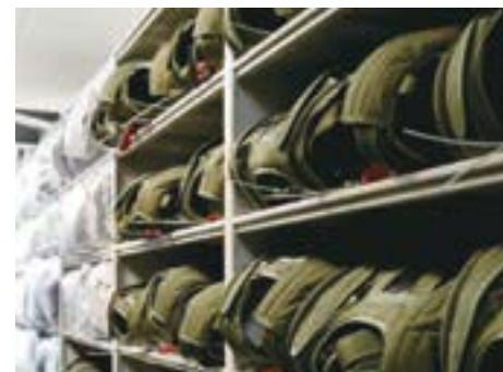
High-Density Mobile Storage for parajumpers