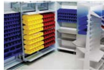
FrameWRX™ Storage System With the flexibility to adapt to changing needs quickly and easily, our modular FrameWRX™ Storage System provides highly customizable storage. Hang bins, trays and pegs on its innovative rail system to maximize storage of tools and parts and optimize workspace.