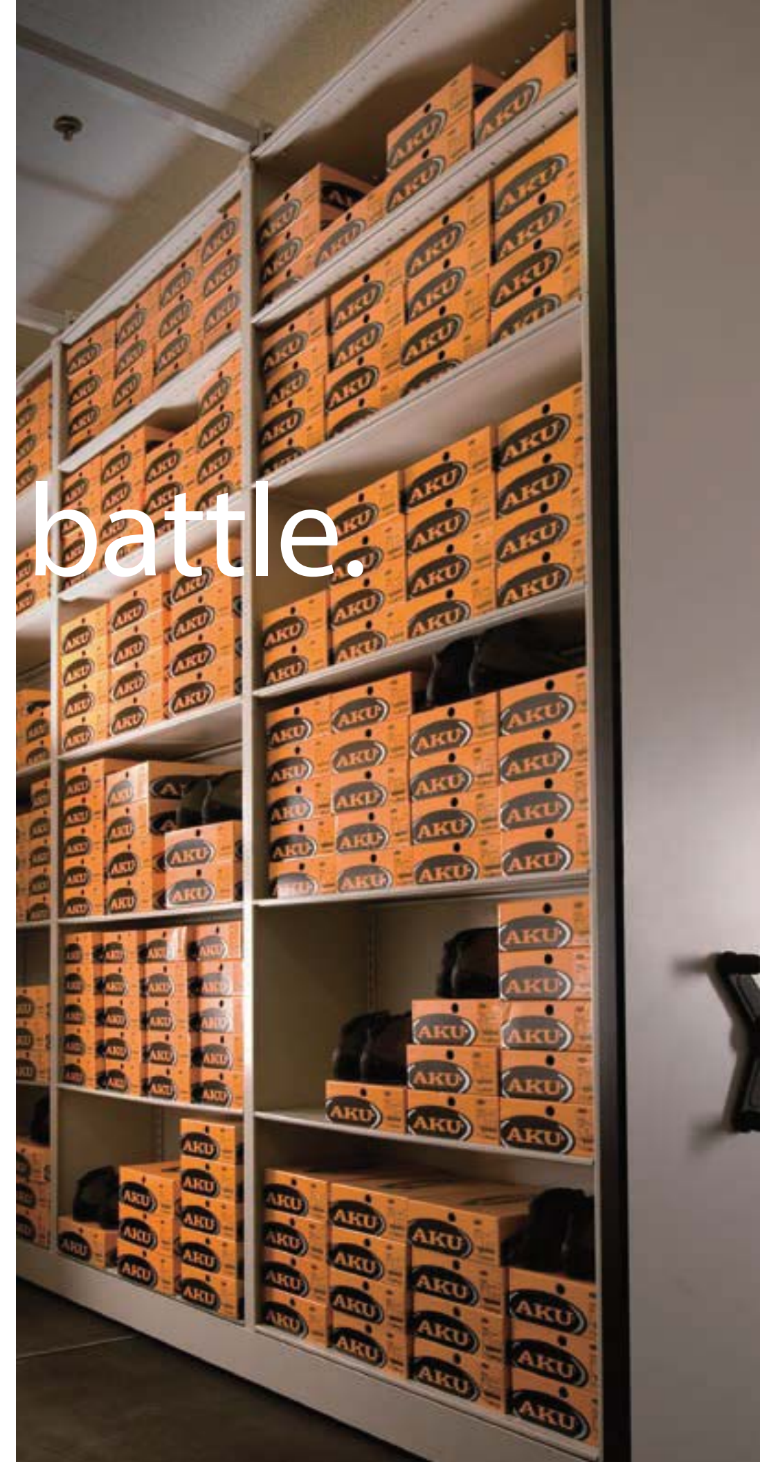
Mechanical-Assist High-Density Mobile Storage Systems Easily moved to provide quick access to the desired aisle, our Mechanical-Assist High-Density Mobile Storage Systems

In your maintenance areas, tools, parts, bench stock, equipment and manuals can be kept close at hand to help increase efficiency in repairing, rebuilding and upgrading vehicles, equipment and facilities.