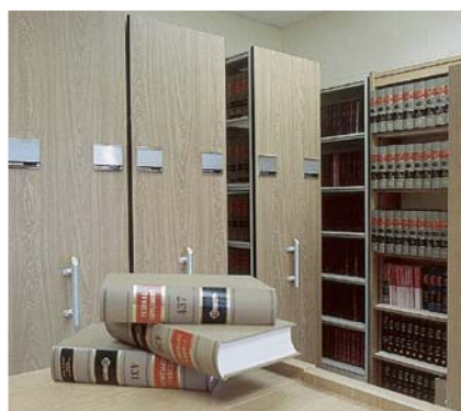
The law library saved enough space to fit inmate work tables.