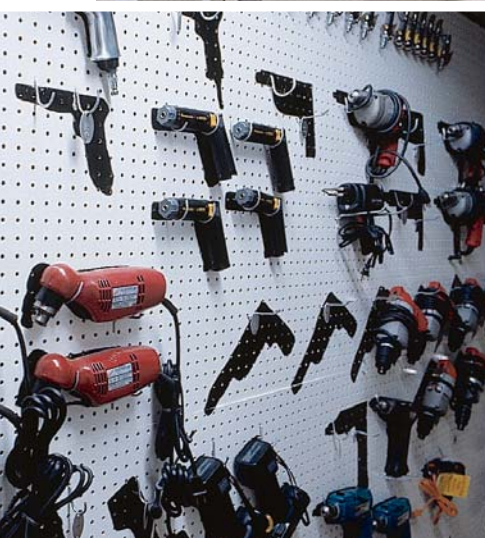
An art rack system stores all inmate manufacturing tools in a secure area.