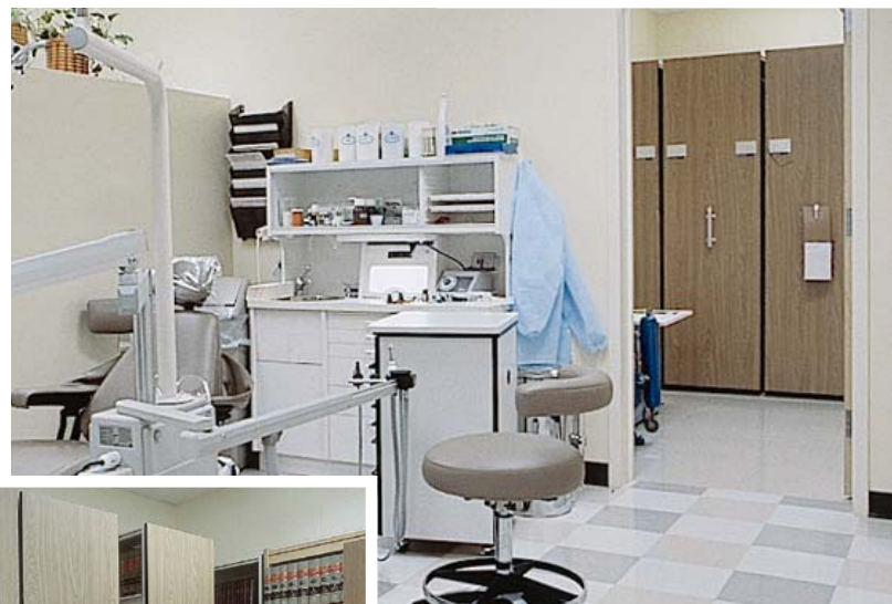
A manual system stores medical/dental records efficiently.